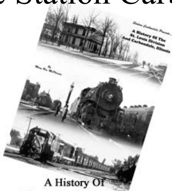
A History Of The St. Louis Division And Carbondale, Illinois

A 20 page booklet on the history of the Illinois Central, the railroads of Carbondale and the St. Louis Division